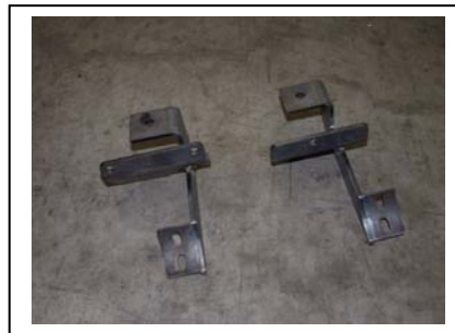
Fig 2 Driver side brackets