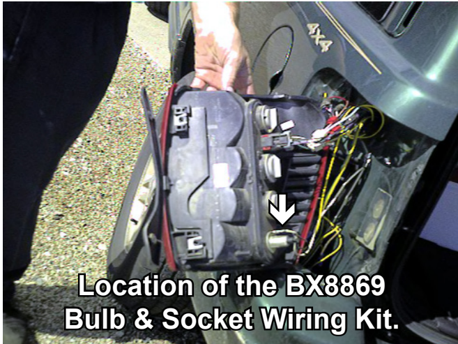
Location of the BX8869 Bulb & Socket Wiring Kit.