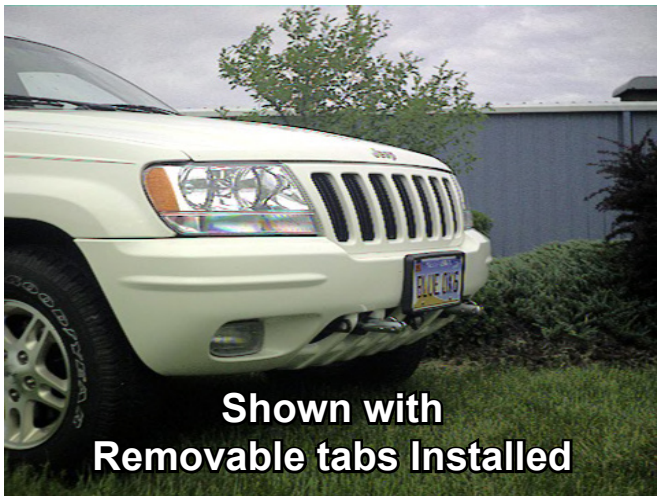
Shown with Removable tabs Installed

Again, thank you for being our customer and for the confidence you have shown in the performance of our products. It is because of customers like you we enjoy the success we have today.