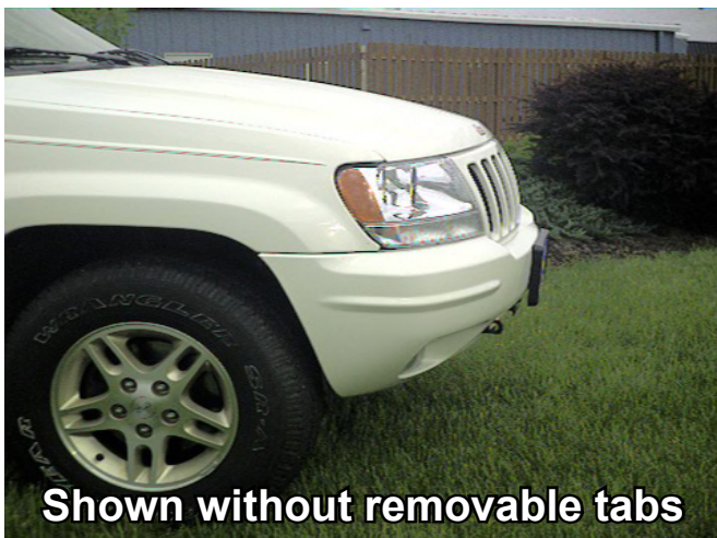
Shown without removable tabs