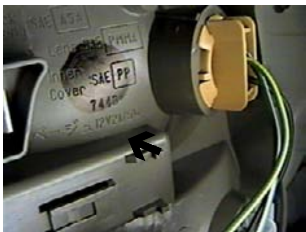
12. Photo of the drivers side tail light assembly and location for the BX8869.