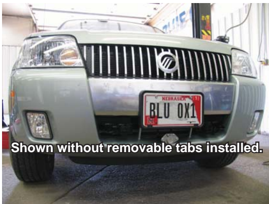
Shown without removable tabs installed.