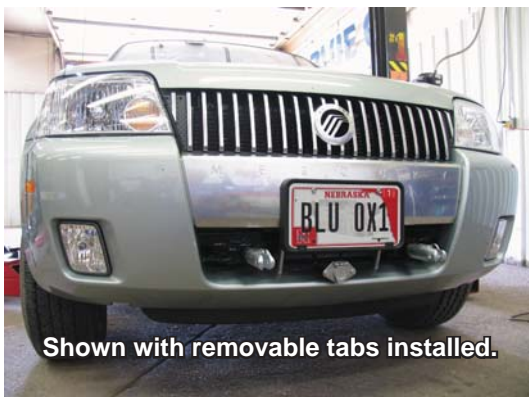
Shown with removable tabs installed.