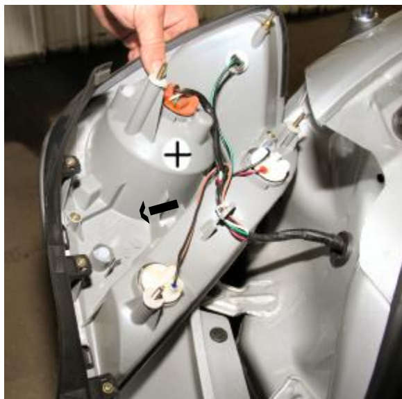
Location for the bulb and socket (Bx8869) on driver's side tail light assembly.