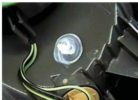
Location for the BX8869 is on the bottom side of upper lens.