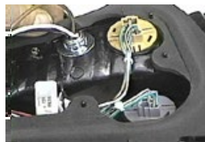
Location for the BX8869.