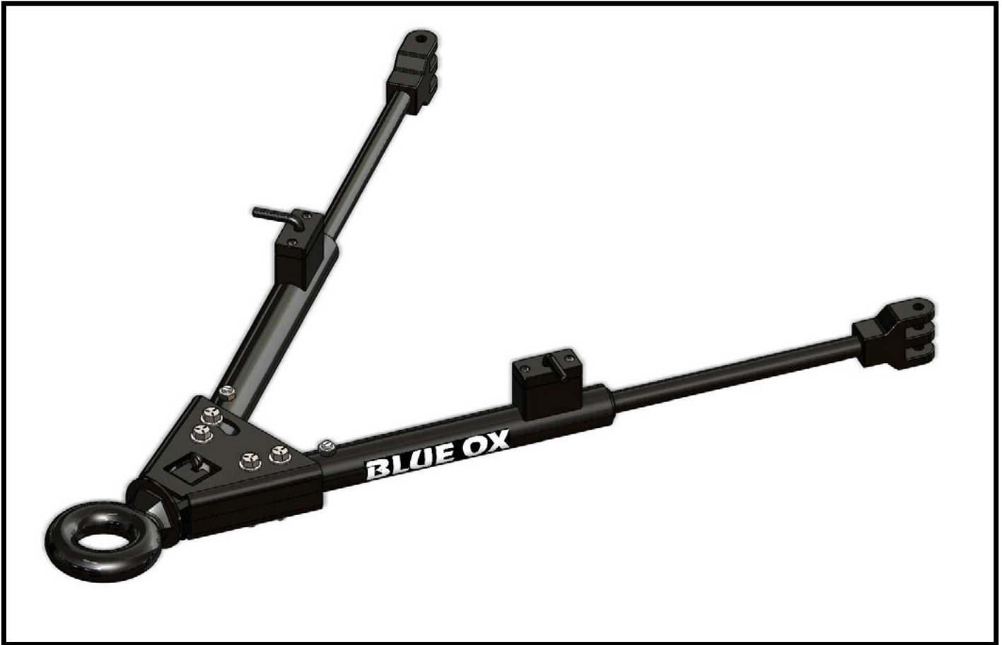
Trion™ Tow Bar (20,000 lb) Pintle Coupler