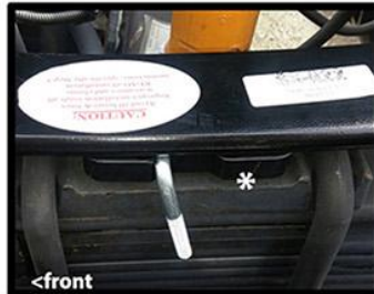
Place PSP11 on top of spring plate flat side up facing, with groove toward the front