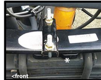
Install the SuperSprings as pictured below, then thread the channel crossplate on to the ubolt. Tighten securely.