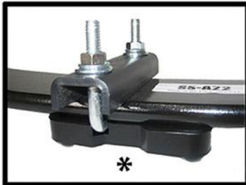
PSP11 with hold-down clamp assembly