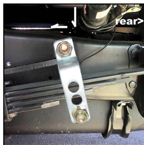
ensure clearance to filler line

Refer to SuperSprings application guide for part selection www.supersprings.com [Tech line #866-898-0720] SuperSprings enhance load carrying capability, handling & towing. Never exceed vehicle manufacturer's GVWR rating.