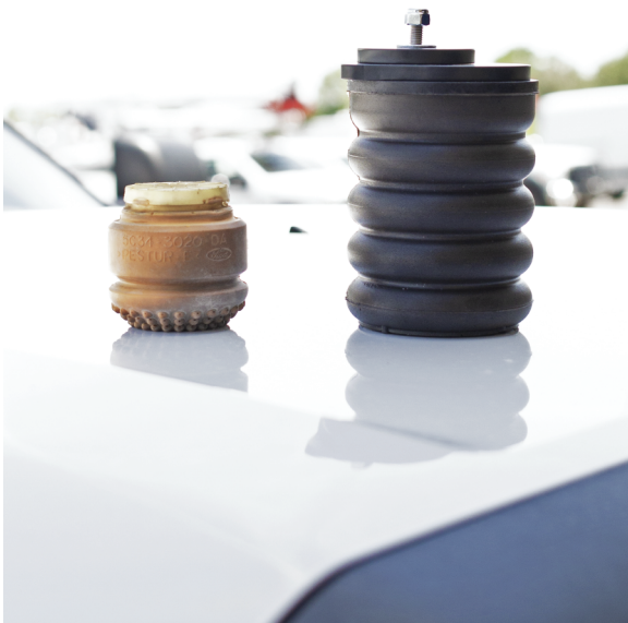
STOCK BUMPSTOP VS. SUMOSPRINGS